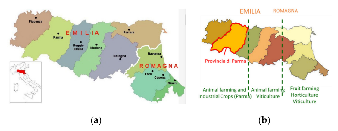
Figure 1. (a) Emilia Romagna region and Province of Parma; (b) Emilia Romagna region and main agricultural sectors.

It is important to note that from the agricultural point of view, the Province of Parma is the largest area under EU organic production in Emilia Romagna. In 2018, there were 859 organic producers and processors and the Used Agricultural Area (UAA) of organic farming was 24,900 ha, representing almost 20% of the total UAA area of Parma Province. Forty-one percent of total organic farmers and processors are small famers (up to 15 ha) representing 11% of total organic UAA of Parma Province (authors' own elaboration based on data for the Emilia Romagna region for the year 2018).